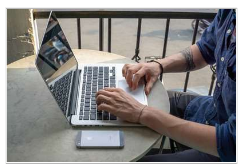
Digital nomad

But does this mean that suddenly knowledge is being managed as never before? We don't think it does, or at least not yet. The new digital habits offer new potential for knowledge management, for sure, but remote working and digital transformation are not enough to deliver knowledge management. Let me explain what I mean.